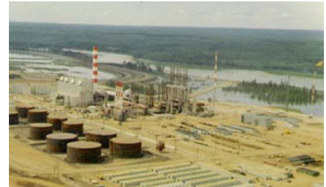
Suncor's Fort McMurray plant in 1964